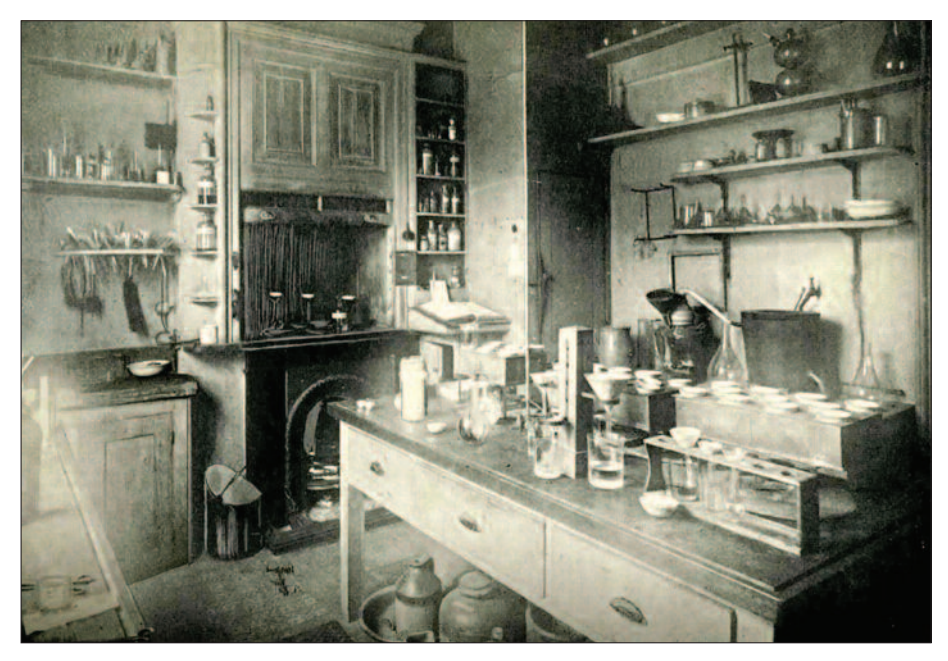
Figure 9. The chemical portion of Crookes' laboratory. Crookes applied his chemical and spectroscopic skills to the study of the rare earths. After radioactivity was discovered in 1896, he studied the radioactive elements.

Crookes expanded his hypothesis to include genesis of the elements themselves: a cooling process of the protyle <sup>7</sup> in stars—he proposed the elements condensed into a statistical distribution of weights but with identical chemical properties. Thus, while the measured atomic mass of calcium was 40, actually there might be some 39, 38, and 41, 42—or perhaps 39.9, 39.8 and 40.1, 40.2, and so on.<sup>12</sup>