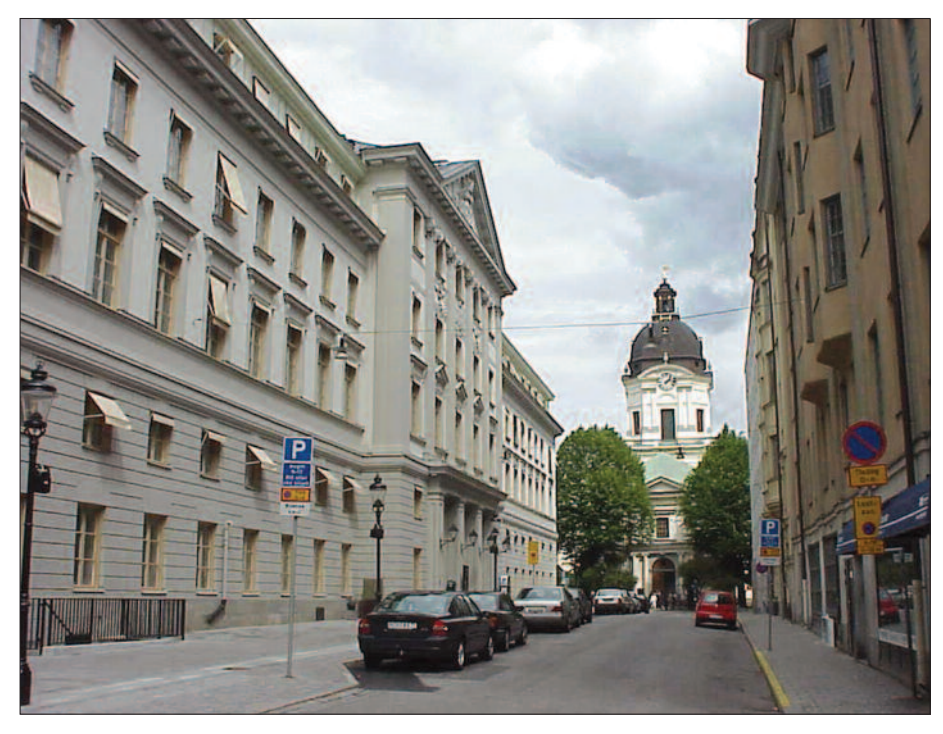
Figure 2. On the left is the building housing the Royal Swedish Academy of Sciences (second site), Wallingatan 2 (N59° 20.26 E18° 03.52), where Mosander lived and worked. Here he prepared lanthanum, didymium, erbium, and terbium.<sup>1</sup><sup>19</sup> The building is now used for general offices. The church at the end of the street is Adolf Fredriks Kyrka [Church], inaugurated in 1774. The view looked the same in Mosander's time. "Father Moses," as Mosander was affectionately called by his friends, proudly told Berzelius (co-discoverer of cerium) that in this building was prepared the only pure sample of ceric oxide in the world — "white, slightly yellowish" (1842).<sup>4</sup>

Figure 3. Historically important rare earth minerals. Gadolinite, (Y, RE)_2 FeBeSi<sub>2</sub>O<sub>10</sub>, from the Ytterby Mine, Sweden; source of the first rare earth discovered, yttrium, and named for the element's discoverer, Johan Gadolin; analyzes (%) for Y/Tb/Tb/Dy/Tm/Yb 16/2/2/5/3. Cerite, (Ce, RE, Ca)_{10}Fe(SiO_4)_6(SiO_3OH)(OH)_3 , from the Bastnäs Mine; source of the first lanthanide; by Klaproth, Hisinger, and Klaproth, analyzes (%) for La/Ce/Pr/Nd/Sm 12/26/3/11/2. Bastnäsite, (RE)CO<sub>3</sub>F, the main source of rare earths both in the U.S. and