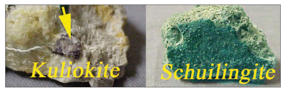
Figure 4. Two unusual minerals illustrating that rare earth distributions can vary widely in nature. Left: Kuliokite (purple crystal), (Y,RE)_4Al(SiO_4)_2(OH)_2F_5 , from the Kuliok River, Kola peninsula, Russia. The mineral has unusually high amounts of the "rarer" rare earths— (%) Y/Gd/Dy/Ho/Er/Tm/Yb/Lu 56/0.4/1.0/0.2/2.0/0.1/3.0/0.1. Right: Schuilingite (bluish coat), PbCu(Nd,RE)(CO<sub>3</sub>)<sub>3</sub>•1.5H<sub>2</sub>O, from Kasompi, Shaba, Zaire, a copper-rich district in Africa. The concentration of europium is incredibly high (europium is the red phosphor in color television screens)— (%) Y/Nd/Sm/Eu/Gd 14/12/8/7/13. Obviously, the mineral did not form by the ordinary volcanic or ion-adsorption geological mechanisms<sup>1</sup><sup>p</sup> but instead by an unusual secondary hydrothermal process.